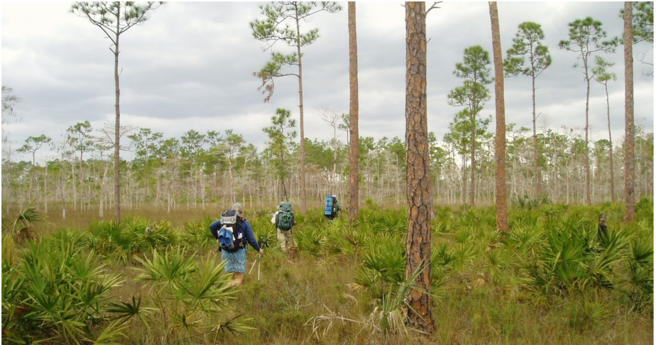
FLORIDA NATIONAL SCENIC TRAIL.