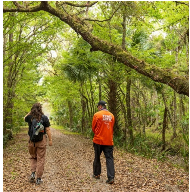
TOSOHATCHEE TRAILHEAD, FLORIDA.