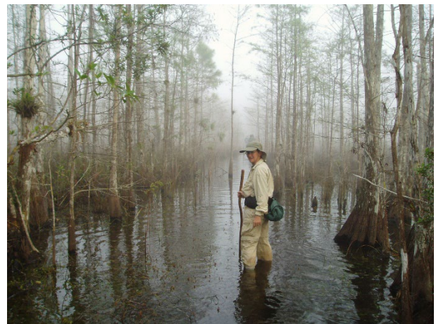
FLORIDA TRAIL.

highest priorities, accelerates connectivity by convening partners, providing tools and resources, and celebrates collective successes through storytelling and art while elevating partners' work. For this effort, the Foundation will primarily prioritize land along the trail with high ecological and connectivity value.