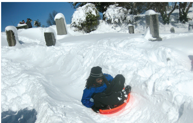
Quirky Congressional Cemetery in Washington, D.C., happens to contain the steepest descent in the Capitol Hill neighborhood—perfect for kids after the record snows of 2010.

Nearly all public cemeteries are open to the public, but they differ widely in the kinds of activities they allow. At the far hallowed end we have the federally owned Arlington National Cemetery, where almost nothing is permitted except walking from grave to grave; jogging and eating are prohibited and there are virtually no benches. Across the Potomac, in a somewhat gritty part of Washington, D.C., Congressional Cemetery puts out the welcome mat to the community, allowing running, picnicking, sledding, children with balls, and even off-leash dogs. The private, nonprofit facility, which gets almost no new burials, had had no steady source of income and had fallen into severe disrepair. With few options, the board took the risky step of allowing off-leash dogs and selling a limited number of canine memberships at $200 a year. (Humans get in free.)