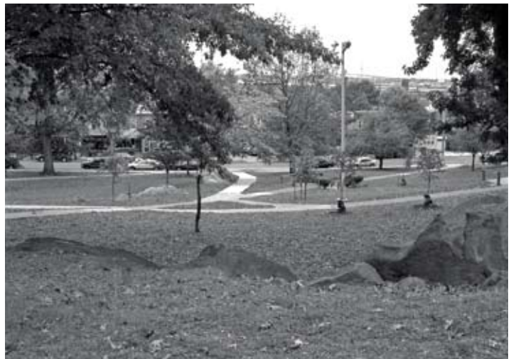
Delaware Center for Horticulture

We then used the residential property tax rate to determine how much extra tax revenue was raised by the City of Wilmington based on the extra property value due to parks. Using a tax rate (sometimes referred to as a “millage”) of $1.397 per $100 in assessed value and the Property Value Calculator, we arrived at $1,080,065. 6 For computations and methodology, see Calculator 3 at www.tpl.org/WilmingtonParksValue .