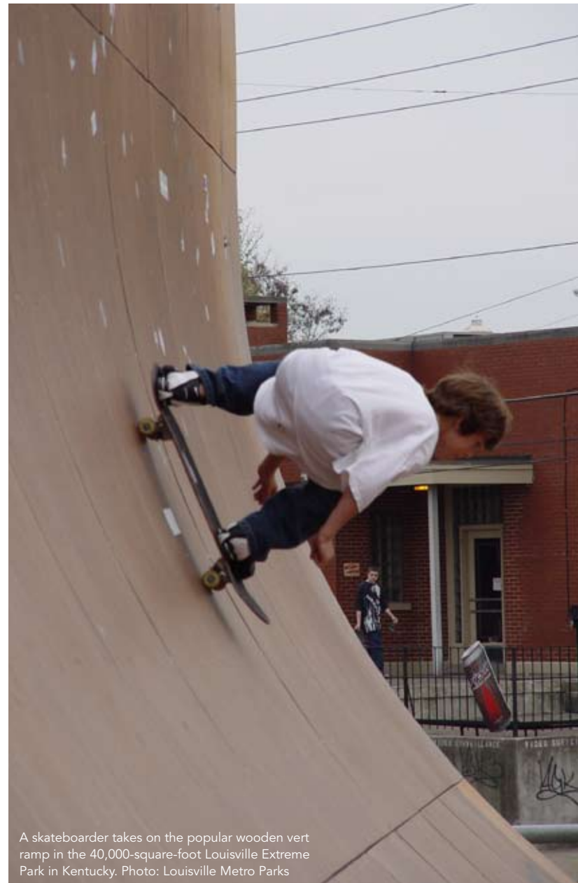
A skateboarder takes on the popular wooden vert ramp in the 40,000-square-foot Louisville Extreme Park in Kentucky.

Many residents consider skate parks to be LULUs—locally undesirable land uses in planner-speak—and they want them as far away as possible. And that frequently is the outcome. One Portland skate park is located under an elevated highway,