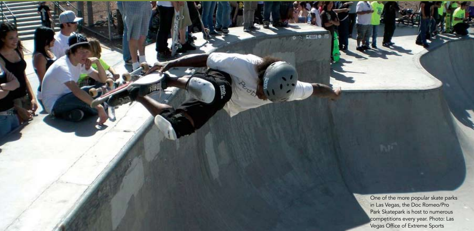
One of the more popular skate parks in Las Vegas, the Doc Romeo/Pro Park Skatepark is host to numerous competitions every year.

This article originally appeared in the May 2009 issue of Parks & Recreation .