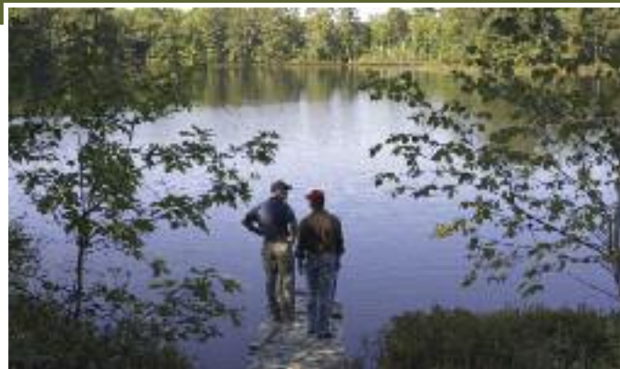
Mirror Lake, Wisconsin