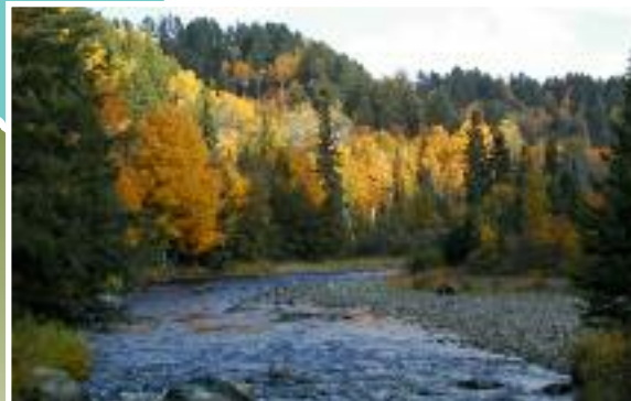
Sturgeon River Gorge, Michigan