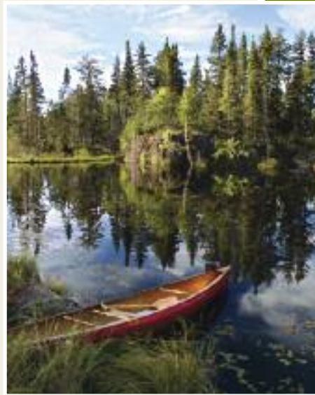
Brandenburg-Fernberg Road, Minnesota

The Trust for Public Land's Northwoods Initiative provides unique solutions to creating public access and conserving natural resources, whether it is protecting a community's namesake lake or preserving thousands of acres of forestland. The need for The Trust for Public Land is dramatically increasing. Communities and public agencies have come to depend on The Trust for Public Land to assist in meeting their growing demand for land conservation before important lands are permanently lost to development. By applying its real estate and financial expertise within this landscape, The Trust for Public Land has leveraged millions of dollars into land conservation successes.