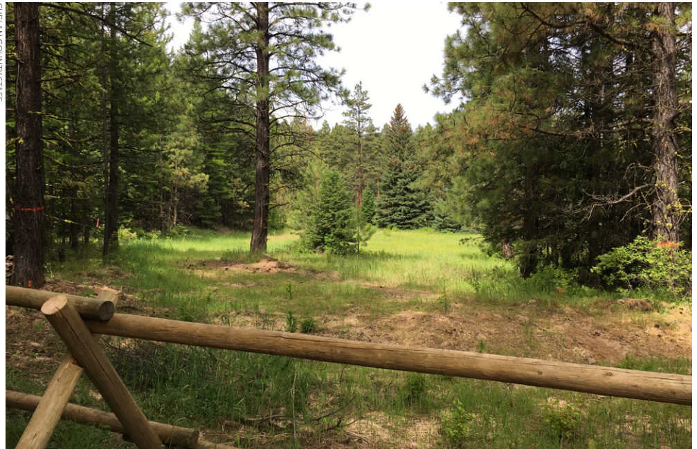
CHELAN COUNTY STAFF

In 2007, Chelan County established the Stemilt Partnership – a broad coalition of agriculture, wildlife, recreation, development, and conservation interests – in response to the proposed privatization of 2,500 acres of public land owned by the state in the Stemilt basin. The Partnership worked with Washington Department of Natural Resources (DNR) and The Trust for Public Land to create a plan for the landscape based on the needs of the community. The community’s vision for this area included protecting the land for three main purposes: water storage, habitat, and recreation.