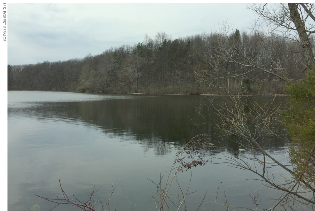
U.S. FOREST SERVICE