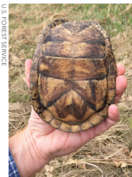
U.S. FOREST SERVICE

The CFP investment in the Portman Nature Preserve provides value to the local community by providing important and much needed access to outdoor natural areas, bolstering water quality, and providing habitat for a variety of game and non-game species.